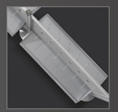
Small footprint maximizes sales per square foot.