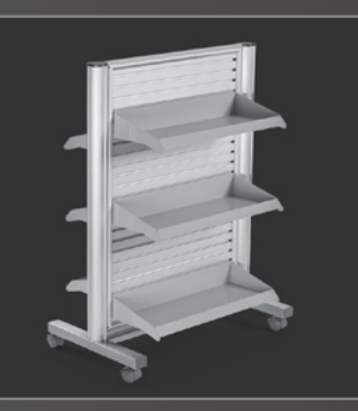
Mobile merchandisers keep your plan nimble.