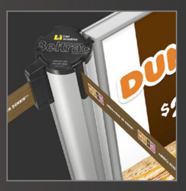
Seamlessly integrate merchandising, branding, and queuing.

We invite you to learn more about in-queue merchandising and the flexible, versatile, affordable NeXtrac Merchandising System from Lavi Industries, the leader in queue management solutions for over 40 years.