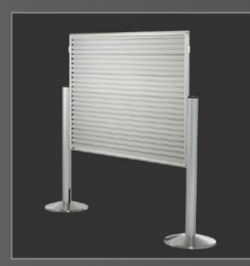
Easy to install — Sets up in minutes, not hours.