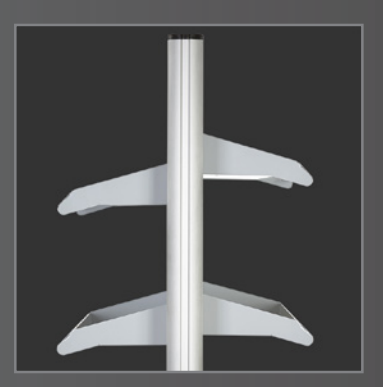
Slim, double-sided design fits virtually any space.